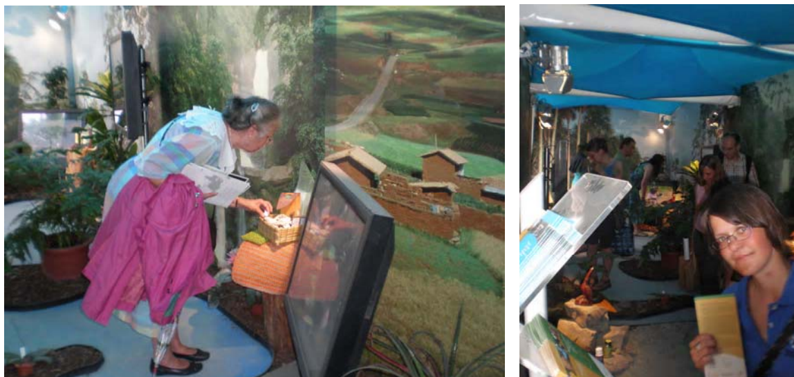
Visitors of the Sala Andes - Amazonia Bonn, Germany

Visitors of the Stand Sala Andes - Amazonia, had a unique experience with the natural beauties of both regions while learning about promissory biodiversity species and products.